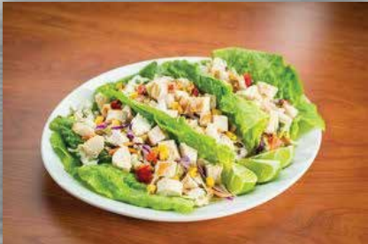
Chicken Lettuce Wraps