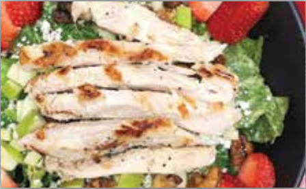
Chicken Apple Walnut Salad