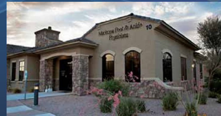
Two convenient locations