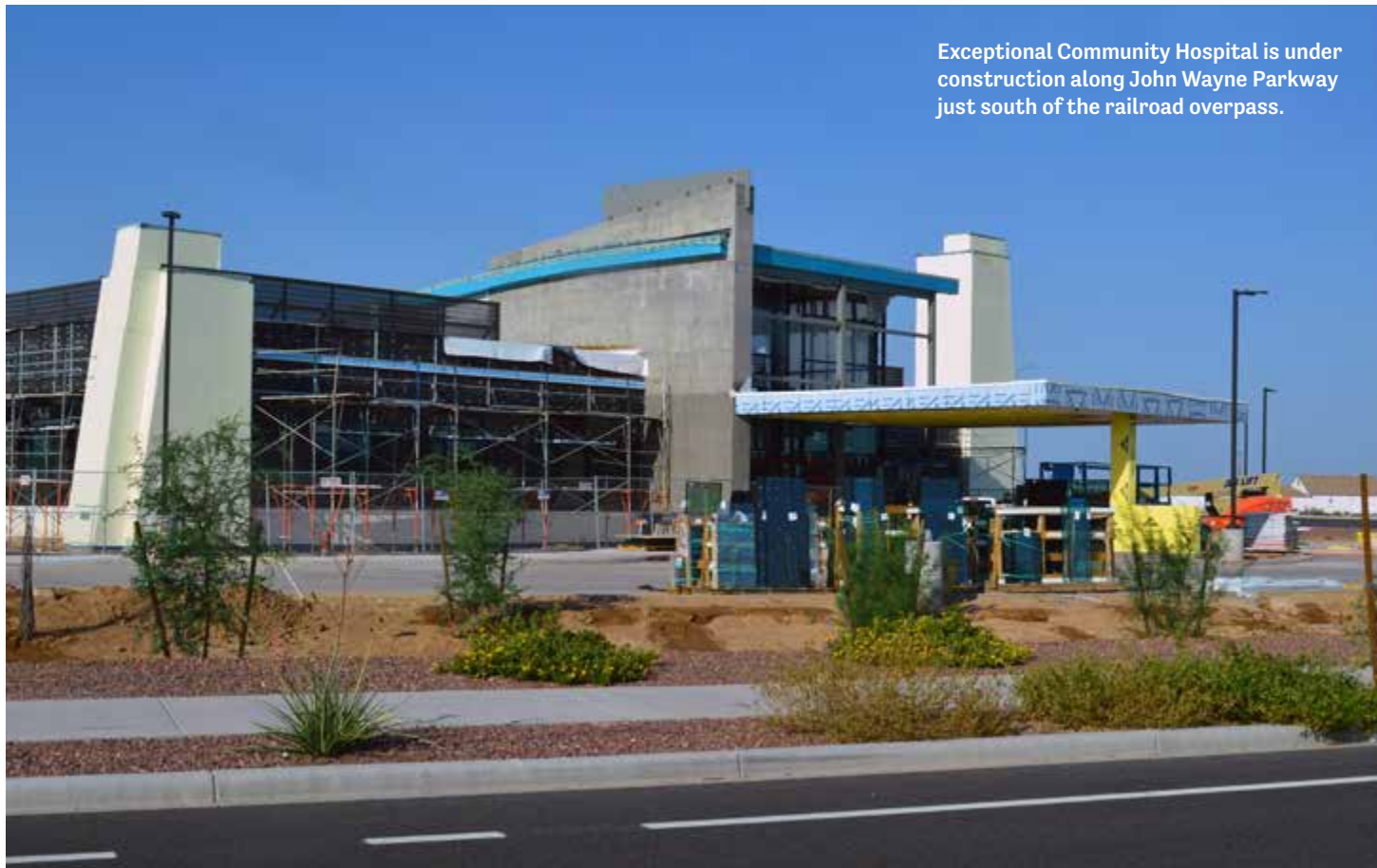
Exceptional Community Hospital is under construction along John Wayne Parkway just south of the railroad overpass.