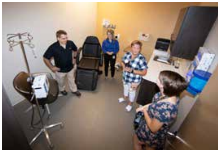
Exceptional Community Hospital opened its Fast Track emergency department during the summer.

community is ready for more services, and Exceptional is preparing to provide them.