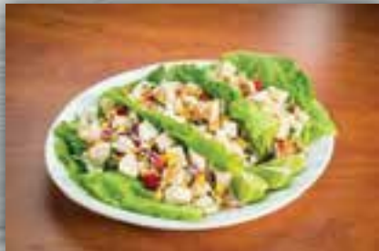
Chicken Lettuce Wraps