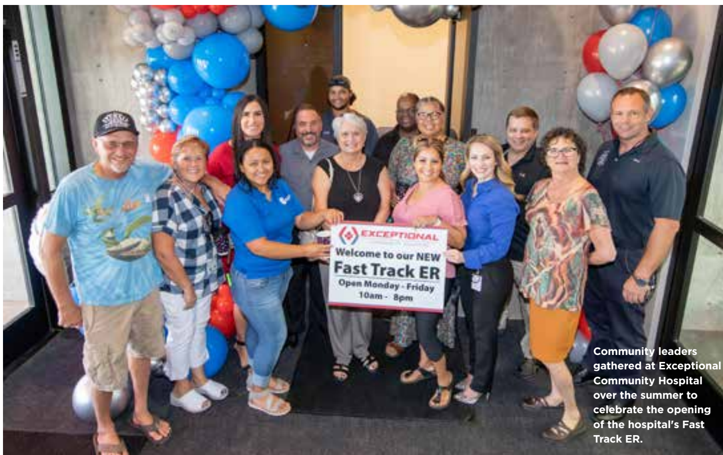
Community leaders gathered at Exceptional Community Hospital over the summer to celebrate the opening of the hospital's Fast Track ER.