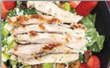
Chicken Apple Walnut Salad