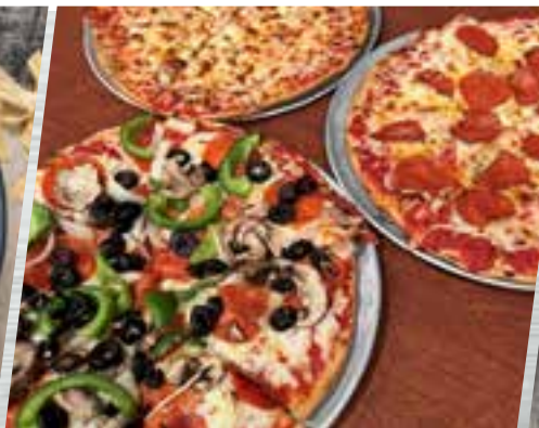
Gluten Free Pizza