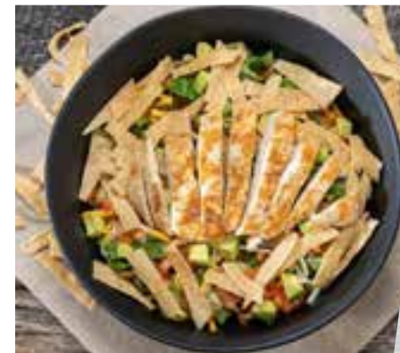
Southwest Chicken Salad