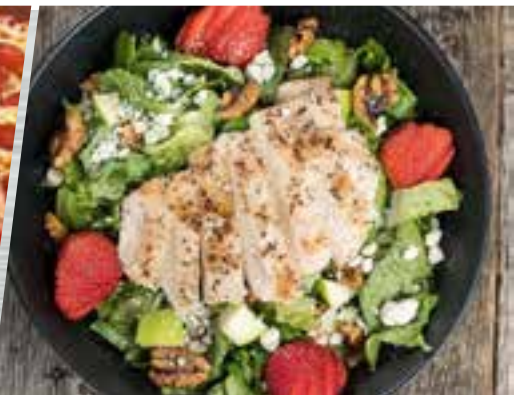
Chicken Apple Walnut Salad